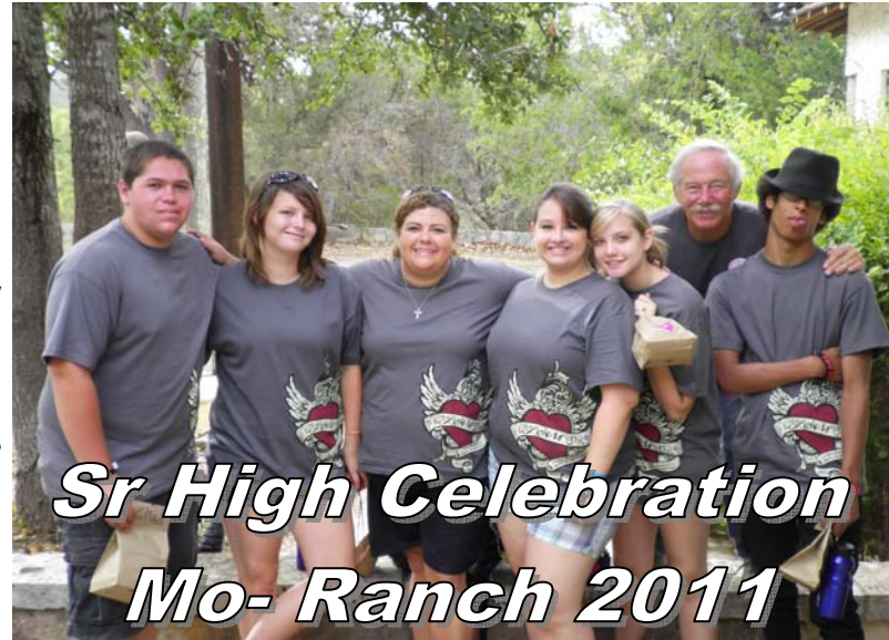
Sr High Celebration Mo-Ranch 2011

The common theme all summer, that could not be taught enough, was to Drink Water! Each day, we looked forward to the refreshing afternoons in the Guadalupe and Vespers each night reflecting on what God was doing in our lives and how He was loving us. Again, the echo of asking to go back next summer was heard as soon as we left.